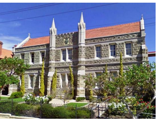
Two-storey extensions at CBC Fremantle completed in 1939 ( The West Australian , 12 November 1938, p.8; Google 2013).